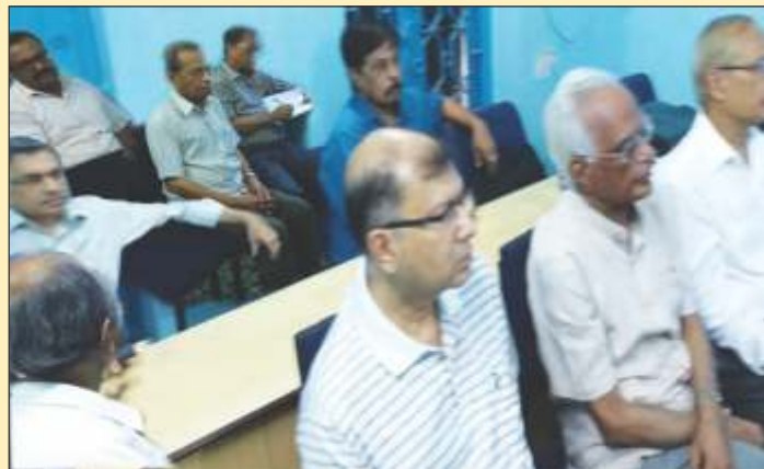
A section of gathering at the Get-together meeting