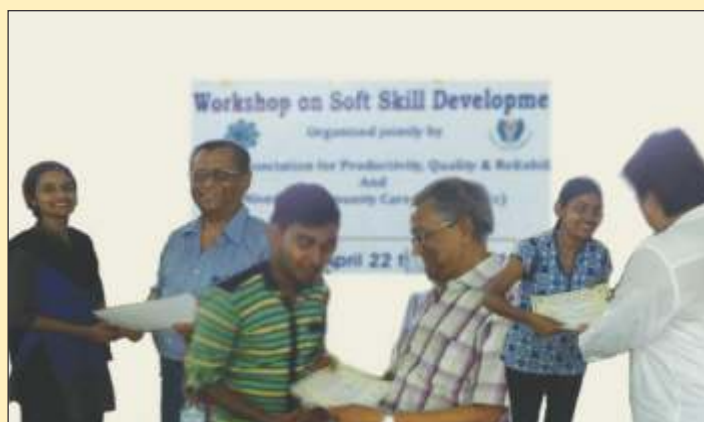
Distribution of Certificates at the Workshop on Soft Skill Development at NCCC

family business after school hours would be considered employed even if he/she received no remuneration. The income of the head of the family is taken as the income of the whole family. A housewife cannot be considered to be employed because she works for her own family only. Prostitution and betting are economic activities but in India those engaged in these trades cannot be considered as employed because these trades are illegal.