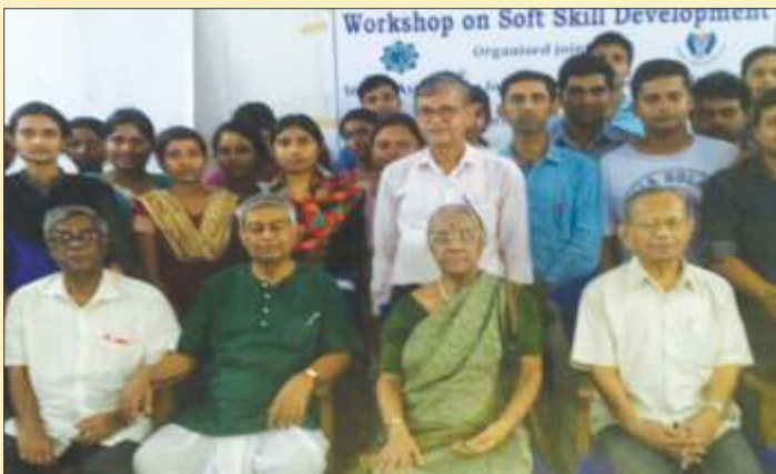
Participants and some resource persons at the Workshop on Soft Skill Development at NCCC.

This uncomfortable report is perhaps not unexpected in the backdrop of some recent unfortunate incidents taking place in the country betraying blatant intolerance on the part of those in power and their followers in religious beliefs, customs, food habits and the like, and more importantly, in matters of freedom of expression.